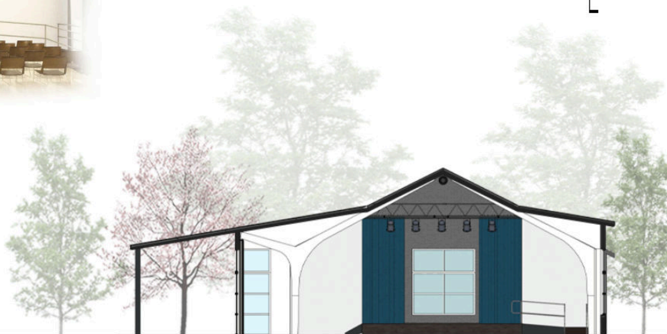
Section 02 Scale: 1/18" = 1'-0"